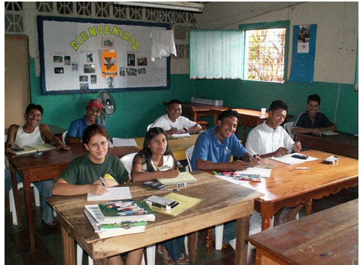
APLV is proud to have inaugurated a new technical center especially for our school that provides all facilities for the students to study and live comfortably.

of drinking water systems. The school is the only educational institution in Nicaragua that trains technicians in the construction of rural drinking water systems. By building local capacity to manage drinking water systems, ETAP contributes to the sustainability of the drinking water projects, as well as increasing autonomy and self sufficiency in the rural areas. To date, the school has graduated 21 water technicians that now work for local governments and non-profit organizations.