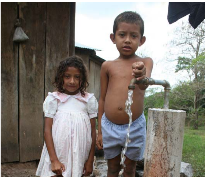
Children are the biggest benefactors of our projects - the bulk of infant disease and death in Nicaragua is due directly or indirectly to water-born bacteria, viruses and parasites

In 1996, APLV founded ETAP (Escuela Tecnica de Agua Potable) to train youth from low-income rural Nicaraguan communities in the design, construction and maintenance